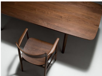
Textile/ Garment/ Wooden furniture