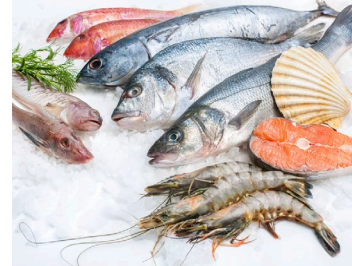
Packaged & Frozen food